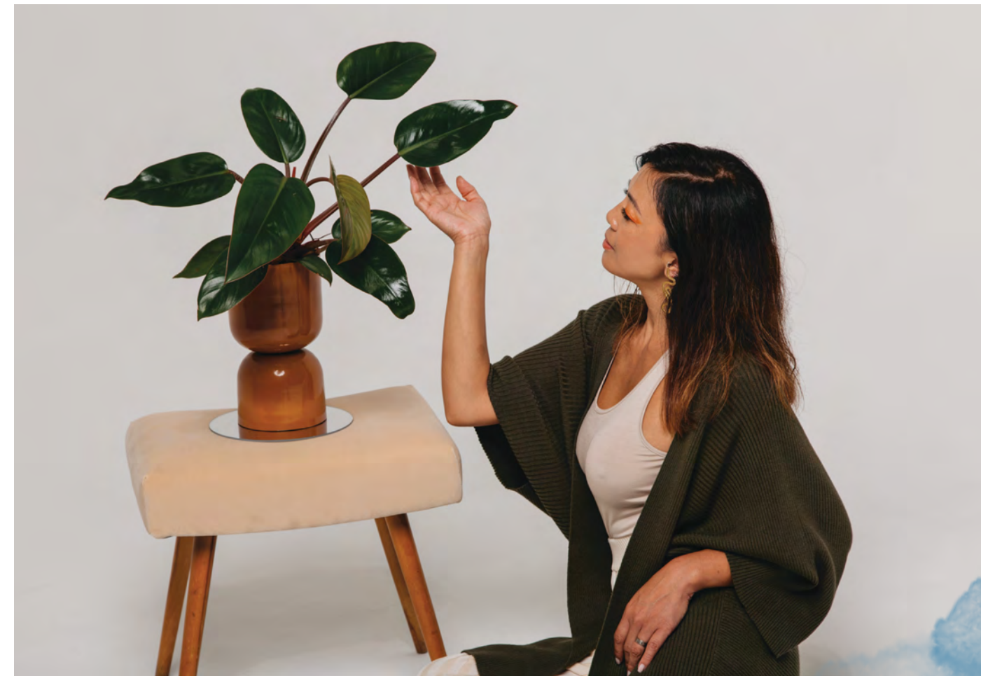
Miko Cardie G730 PINE GREEN