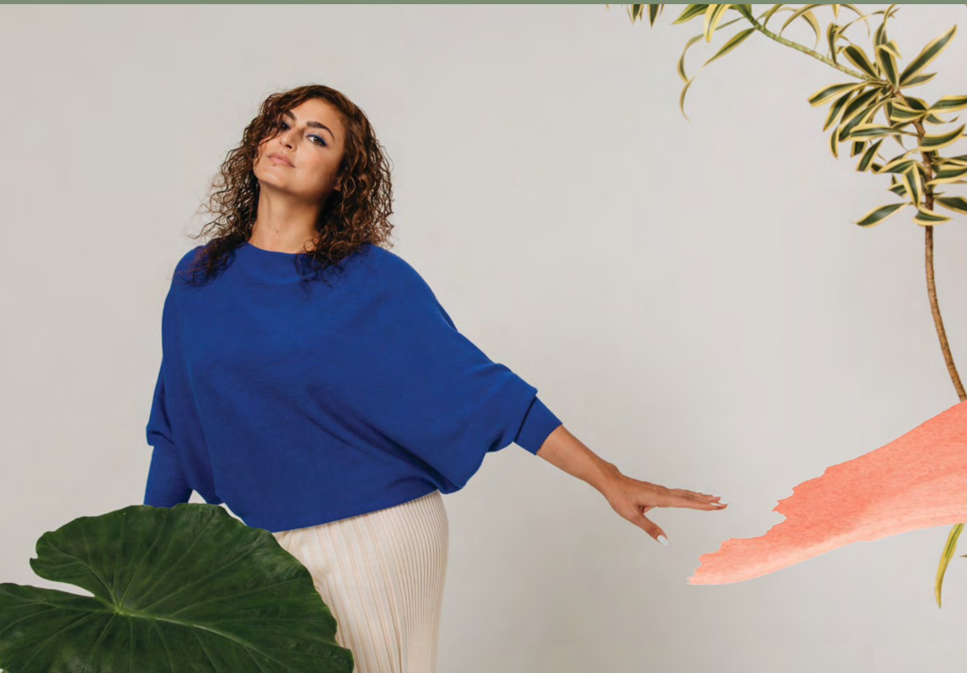
Ryu Top G550 ROYAL BLUE